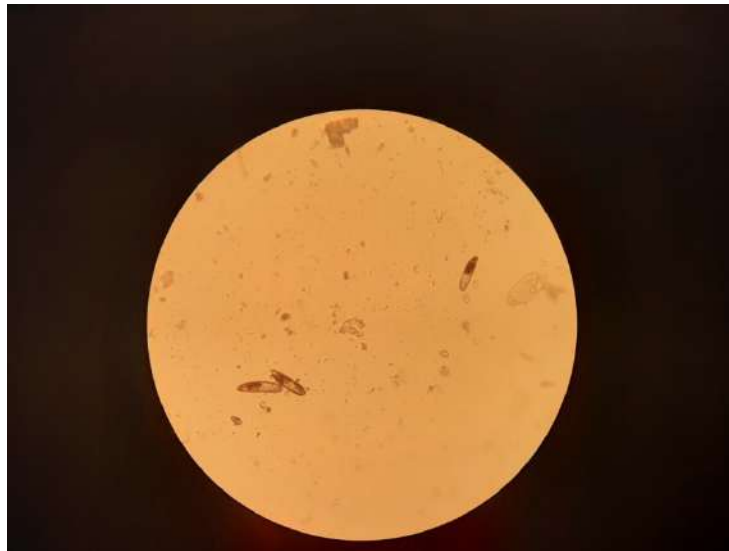
Figure 1. Eggs of Syphacia spp. (collection 10 × 10)

The drug used, namely paste vermicol, had a 100 % helminth elimination effect, since 12 days after treatment of laboratory mice from syphaciosis invasion, the extent and intensity efficiency were 100 %. No eggs of pathogens were found in the field of view of the microscope.