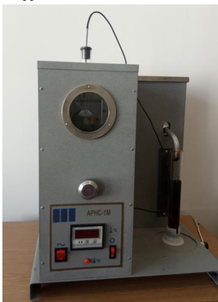
Fig. 1. Apparatus for frictional distillation of fuel

To understand the course of evaporation and mixture formation, during the combustion of diesel fuel and biodiesel, the fractional composition of the fuel was determined according to the distillation temperature. According to the distillation temperature indicators one can distinguish the presence of heavy fuel fractions, which worsen mixture formation, induce the formation of carbon deposits and increase smoke. Measurements of the fractional composition according to the distillation temperature were carried out on an ARNS-1M apparatus.