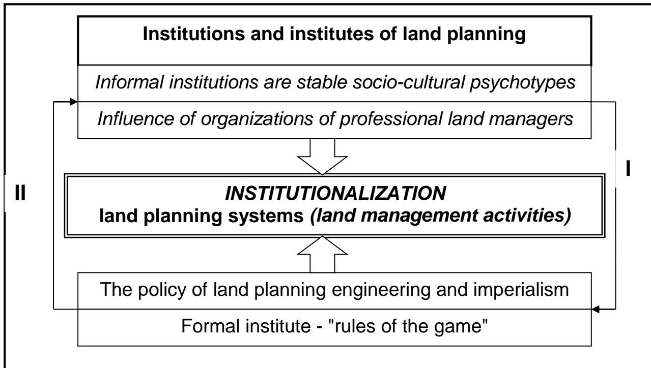
Fig. 3 Logical and substantive scheme of theoretical and applied enrichment of the "System" and the transformation into the "Institution" of land planning

Therefore, it becomes clear that the phenomenon of the Institution absorbs the phenomenon of "System" of land planning (Fig. 3).