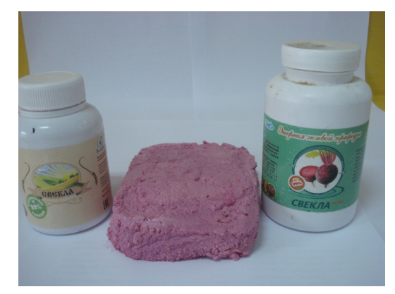
Fig. 1. Cryopowder "Beet"

determining factor in the application of the cryo-additive "Beet" was to retain the standard characteristics of sweet curd masses.