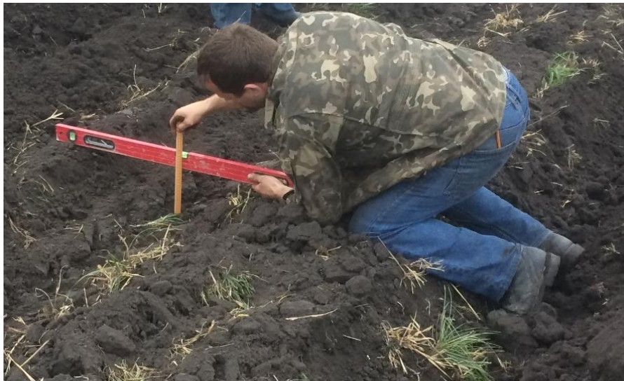
Fig. 1 - Measurement of the track depth after the MTU passed

When performing experimental studies, the MTU was used as part of a 4WD tractor Kyi-14102 with a total weight of 37.5 kN and a plow PRO-3 with a weight of 8.5 kN (Fig. 1). The weight on the rear axle of this MTU with a raised plow was 36.5 kN. To determine the maximum possible depth of the track, a rectangular section of the floor with a length of 150 m and a width of 100 m was previously plowed. After installing the appropriate pressure in the pneumatic chambers of the wheels, the MTU made some distance on freshly plowed soil while fixing the depth of the rear wheel track (Fig. 1). The average value of 10 measurements made at different points along the length of the experimental section was taken as the track depth. An experimental study of the change in the geometric parameters of the contact zone of the tractor tires with a change in the pressure in the pneumatic chamber of the wheel was performed. To find the contact area of the wheel with the ground, a geometric analysis of the wheel imprint on the ground was performed (Golub et al. , 2019).