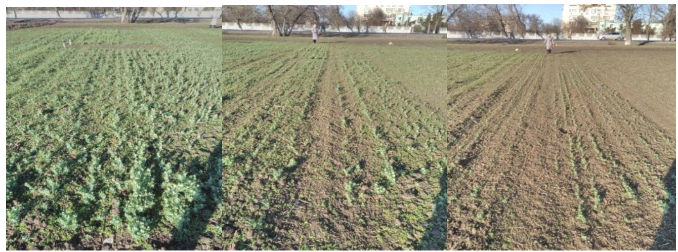
First time of sowing

Plants of the Darunok Stepu variety of the first sowing